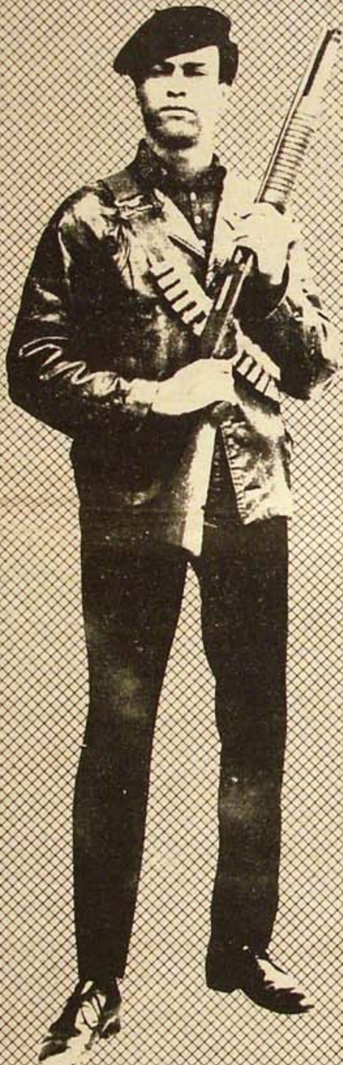
Huey P. Newton Minister of Defense Black Panther Party