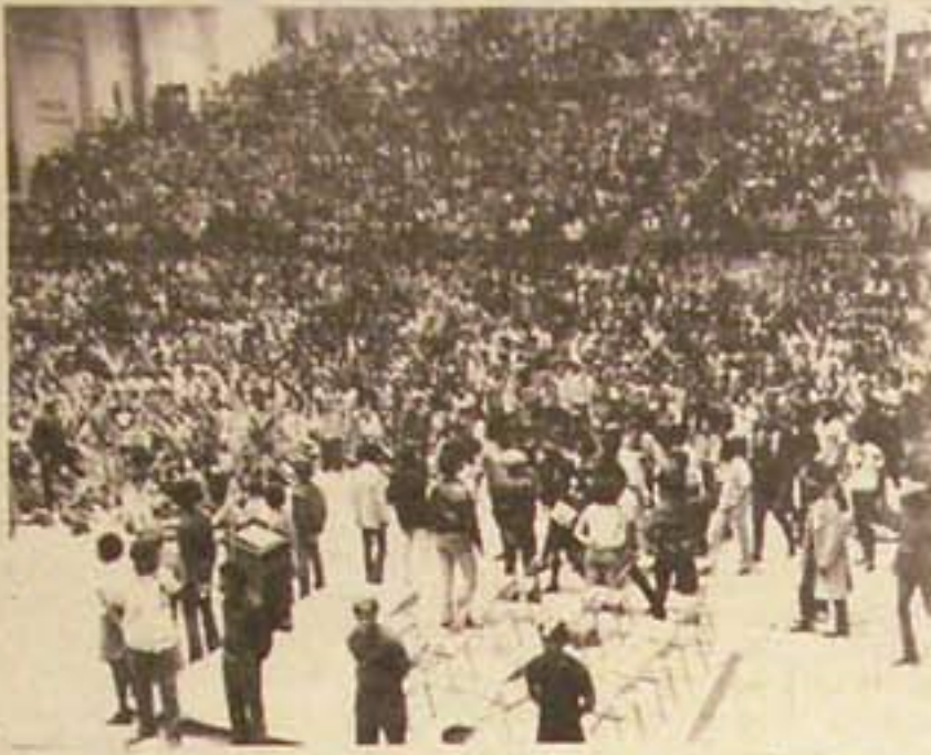
The people are the motivating force.

There is going to be a revolution in America. It is going to begin, in earnest, in our time. The multitudes in Philadelphia at the Revolutionary Peoples Constitutional Convention were overwhelmingly poor and black and, most significant of all, typical; the stunning events of September, 1970, in Philadelphia could have happened anywhere in America. There were no busses of white students and peace people from outside (they will all make the most important choice of their lives by Christmas).