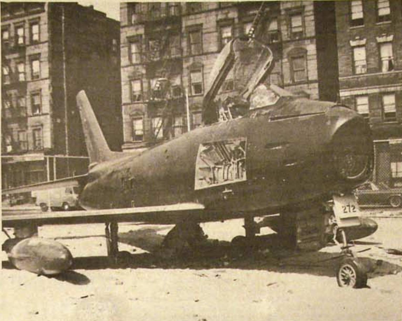
JET PLANE IN HARLEM

Historically, whenever Black people began to look around and see the conditions in which they were living, when they began to