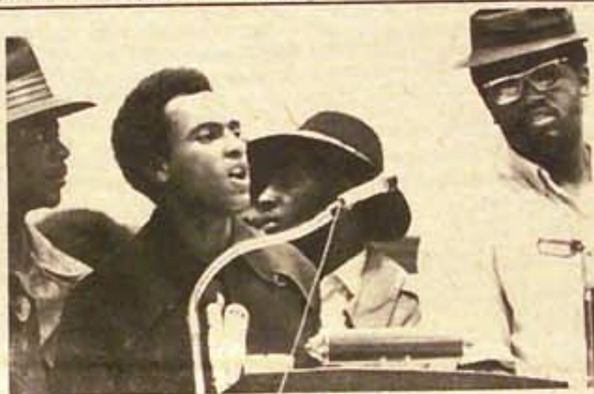
HUEY P. NEWTON MINISTER OF DEFENSE

The United States of America was born at a time when the nation covered relatively little land, a narrow strip of political divisions of the Eastern seaboard. The United States of America was born at a time when the population was small and fairly homogenous both racially and culturally. Thus the people called Americans were a different people in a different place. Furthermore they had a different economic system. The small population and the fertile land available meant that with the agricultural emphasis of the economy, people were able to ad-